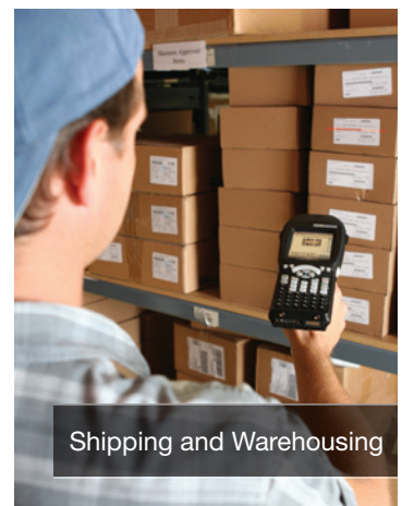
Shipping and Warehousing